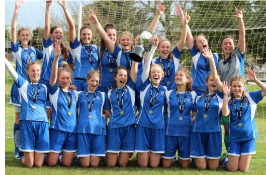
Girls 1st XI Football - 2017 National Champions.

Our Girls Premier Football team earned three major titles during 2017: Auckland Premier Champions, Auckland Knockout Cup Champions and the New Zealand title.