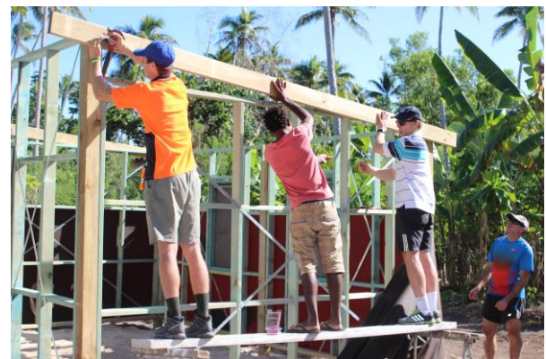
Year 13 Students building in Vanuatu.

This year we sent five service teams abroad during July. Two Middle College teams headed to Cambodia with World Challenge while the Senior College sent two teams to Vanuatu (Year 12 students helped at a village school while Year 13 students built a house). Another Senior College trip travelled to Malawi as part of our World Vision Project.